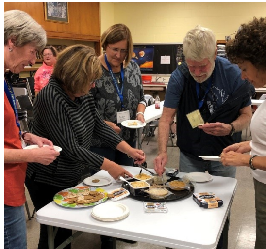
Above left: Fun in the kitchen at Kitchen Kapers XXXV-On the Road to Kitchen Delights