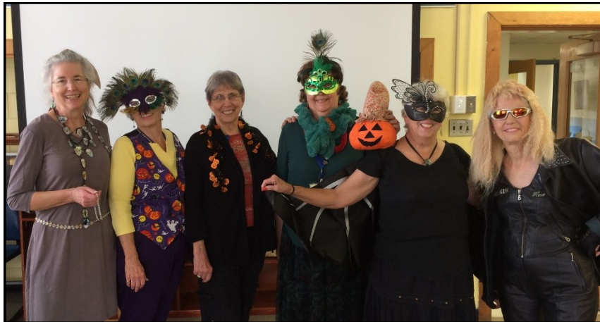
Fun at Halloween -- Guess who!!!!