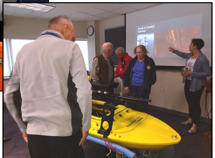
Students in Science of the Delaware Coast held at the Hugh R. Sharp Campus get an up-close view of equipment used in coastal science.