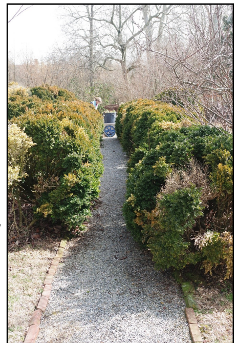
Old boxwoods at Goodstay (3/13/2009)

If you're a gardener interested in helping out with this project and/or ongoing garden maintenance, contact our gardener Beth (beth.stark@me.com). Volunteer day is usually Wednesdays, but more days have been added temporarily in order to put the garden back together after the replanting.