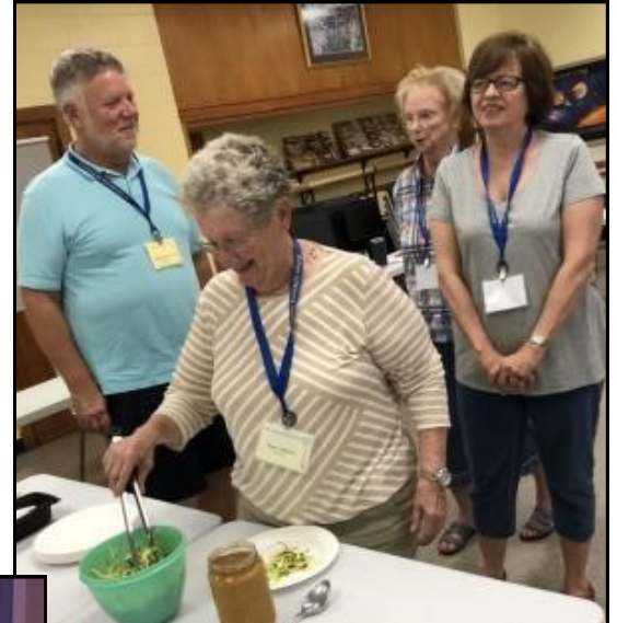
Students sample E-Meals for Everyone