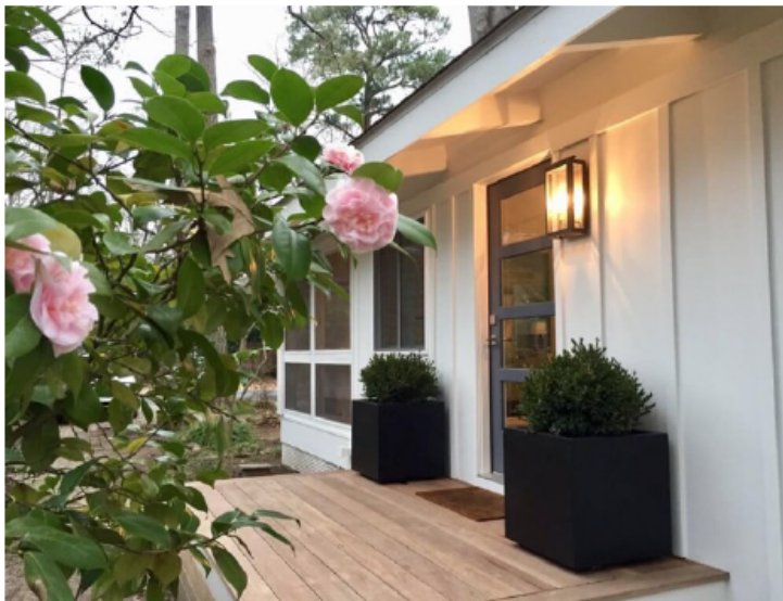
OLLI hosted Cottage #1, Kesmodel/Gaffney, a mid-century modern beach retreat.

The owners, Ned and Matt, commented, “We really appreciated how informed and respectful the docents were about our home and were pleased with the respect they showed the visitors”