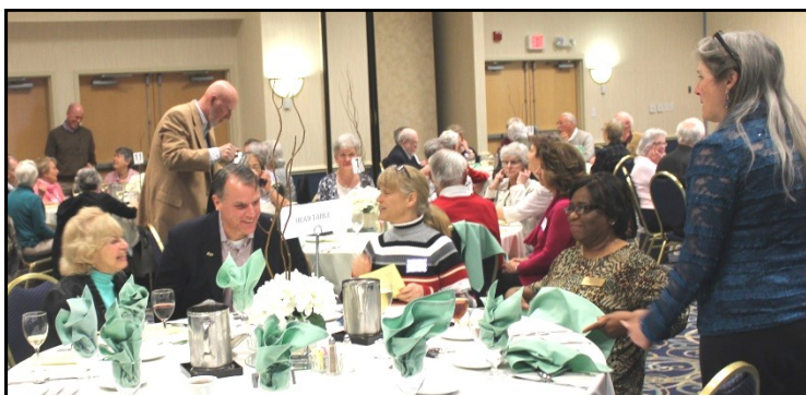
Spring Luncheon, April 16 at the Sands Hotel