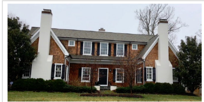
OLLI Docents will host this lovely cottage in 2018.