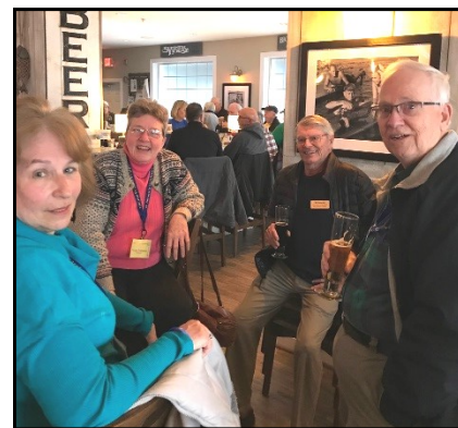
Happy Hour at Big Fish Grill

The OLLI Spring Luncheon was held on April 16 with over 100 in attendance. Tradition Slow Jam played during the social hour. Elder Moments accompanied by Readers Theater group entertained. There was a display of the arts and crafts projects completed this winter. Volunteers assisted with the set-up and registration.