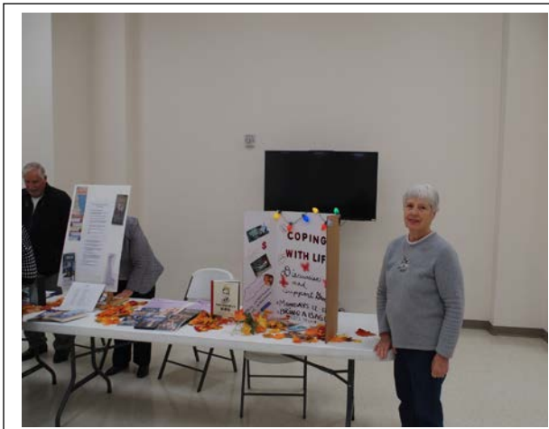
A Sneak Peek at the classes to be offered in the Spring Semester.