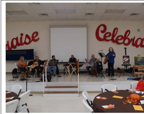
Slow Jam from Lewes OLLI provided the music for the social hour.