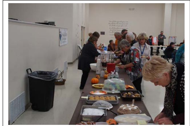
One of the tables of food for the potluck luncheon.