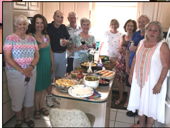
English Country Dance End of June party and dance