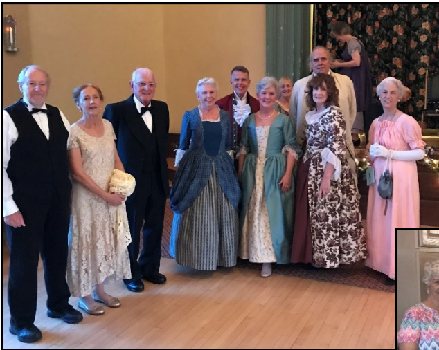
English Country Dancers at the Dover Ball