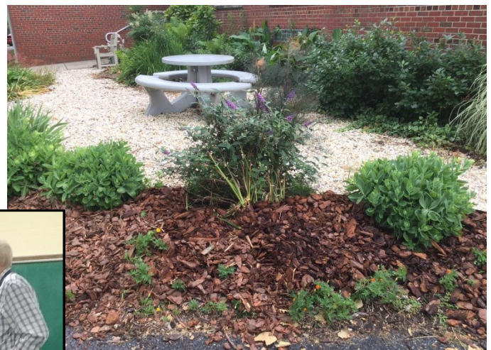
Garden beautification thanks to George Dellinger