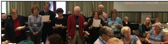
Farewell song, photo by Colleen Olexa

Four language groups (Spanish, German, Italian and French) sang farewell songs in their class languages.