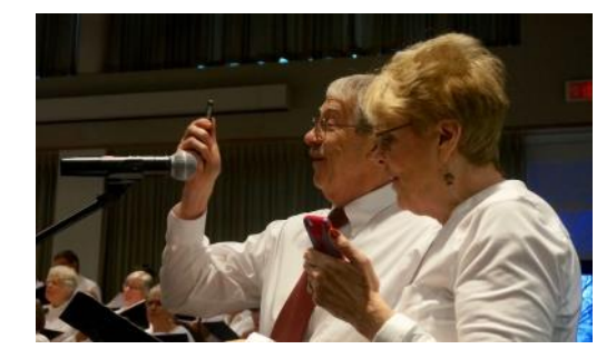
Texting a Merry Christmas