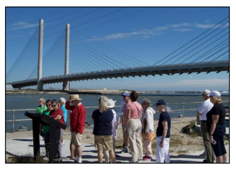
From The Tides, newsletter of OLLI-Lewes/Ocean View, Fall 2016

From 2005 to 2016 OLLI at Widener University was at the Exton, PA campus. In mid 2016 Widener relocated its OLLI to its main Chester campus. Many former members created a new home—the LifeLong Learning Institute at Immaculata University. OLLI Widener also offers a number of courses at partner senior organizations such as Maris Grove.