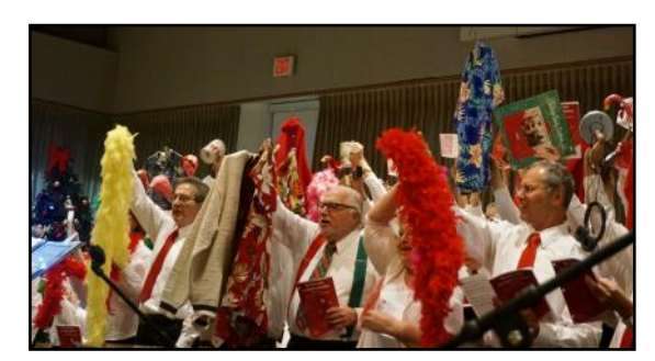
Regifting a Merry Christmas