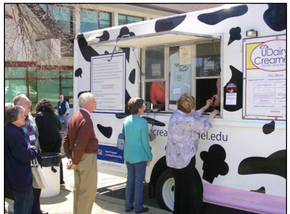
OLLI Welcomes the Moo Mobile (Dairy Creamery)

•This is my first time going to this Series. Very impressive! I will save the week for next time... Thank you for all the planning! And the refreshments were a real plus!