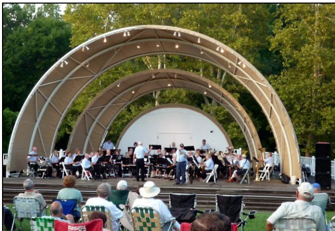
Academy Band, Bellevue State Park, Aug. 13