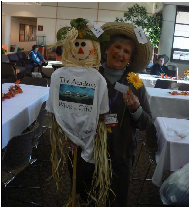
Halloween Breakfast 2007

The seminar will last about one hour and fifteen minutes. Please come and learn how you can become an Academy instructor.