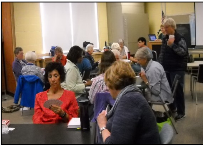
Learning to play Bridge continues to be popular.