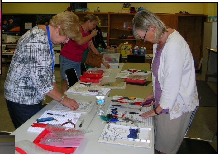
Above: Students work on projects in Stained Glass Fundamentals