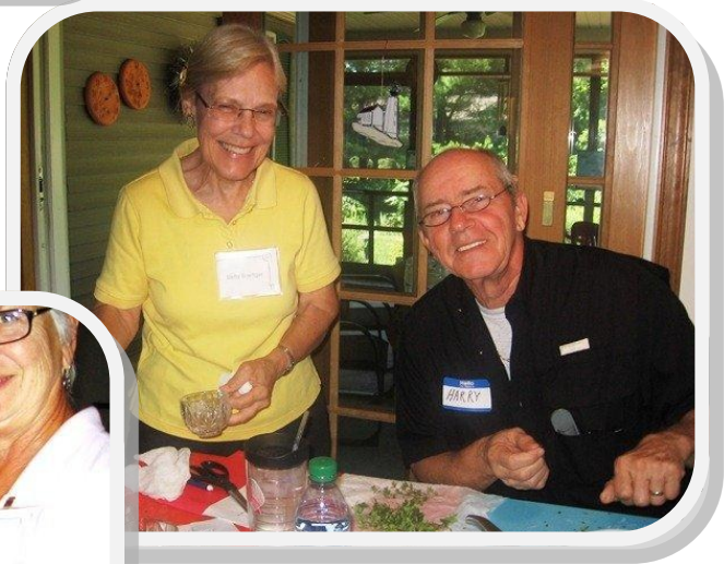
Fun and good food at Kitchen Kapers XIX