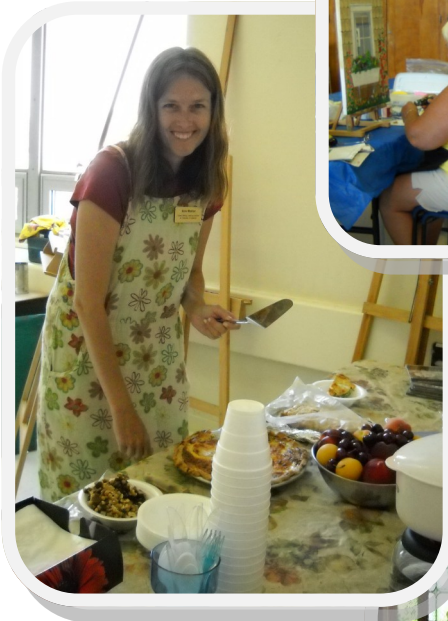
Fun, food and art in Painting Interactive Workshop