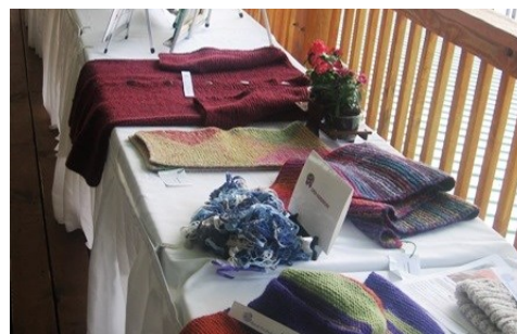
Members displayed their handiwork at the Instructors' Recognition Luncheon.