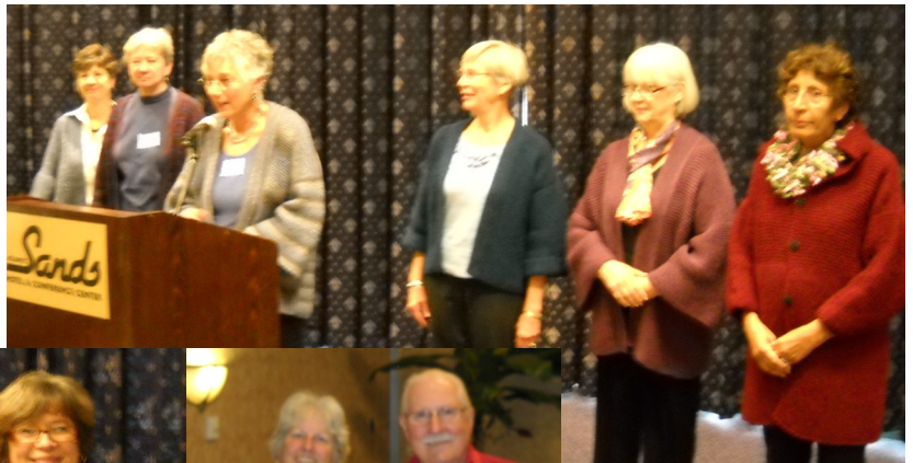
Top: Knitters from Knitting 101 model the kimono jackets made in class.