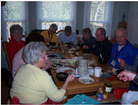
Italian Cooking 101—YUM!