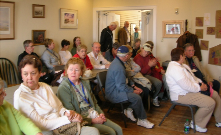
Walk & Talk at the Indian River Life Saving Station