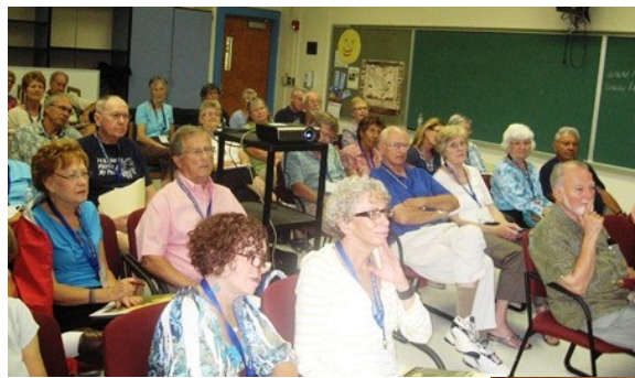
Below: "Walk and Talk" members visit Barratt's Chapel & Museum in Frederica and the Children's' Beach House in Lewes .

Fall orientation was very well attended by both new members and new and returning instructors.