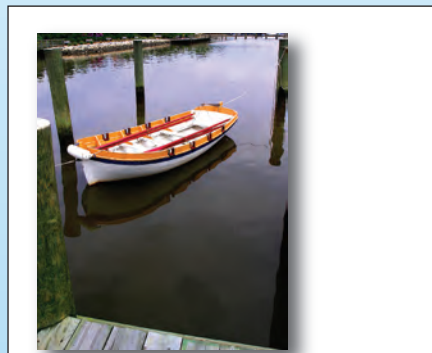
On the cover: “Crew Boat, 2016”