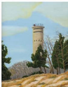
About the cover: Triangulation Tower, Cape Henlopen State Park, Lewes, Del.