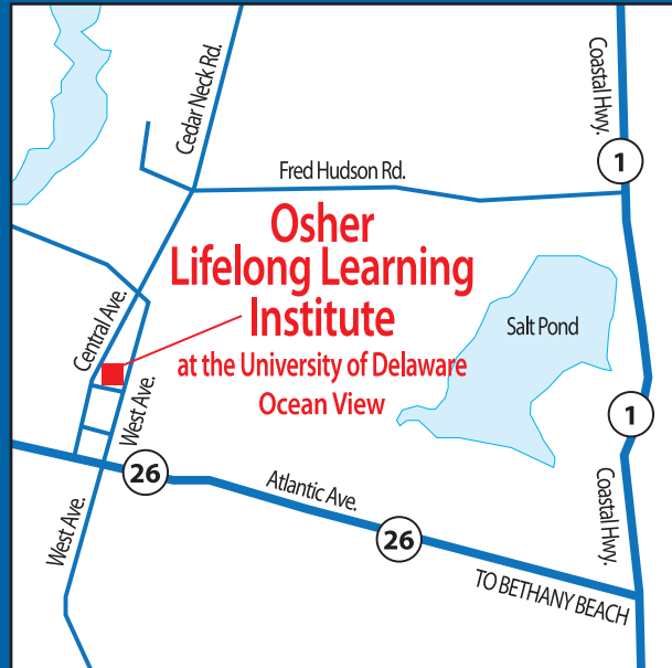
■ Town Hall and Community Center 32 West Avenue, Ocean View, DE 19970