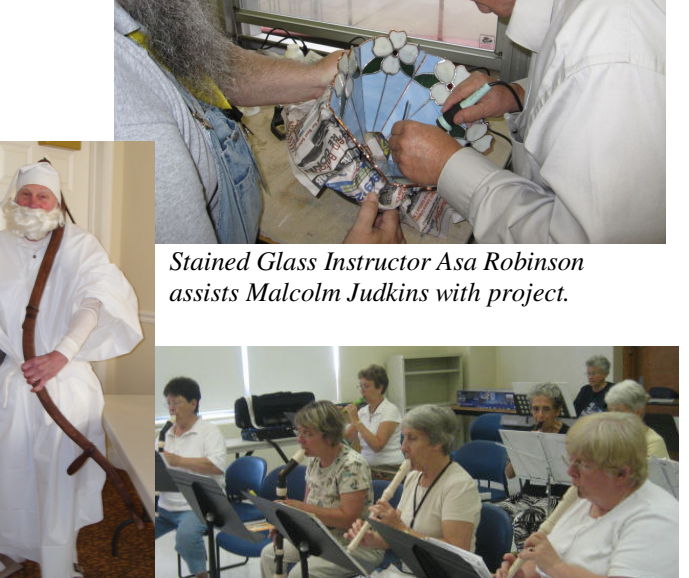
Recorder and Friends class practice.