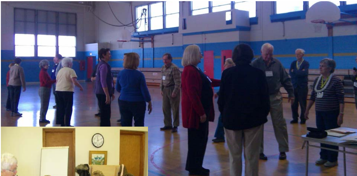
Members enjoyed moving to lovely old songs during a session of English Country Dance for All held in the Lewes school gym.