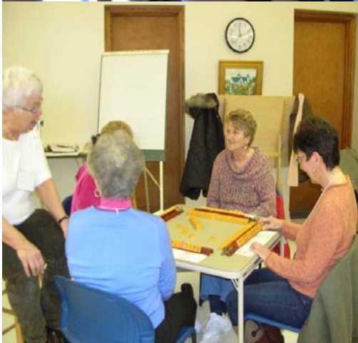
Both beginners and experienced players enjoyed the fun and challenge of the ancient Chinese game of Mah Jongg.