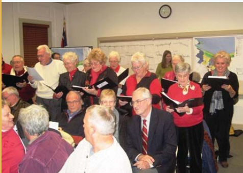
The Elder Moments